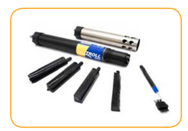
Uninstall all connected sensors and wiper or wiper port plug.